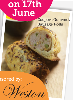
Coopers Gourmet Sausage Rolls

Gifts for Father's Day Perfect on 17th June